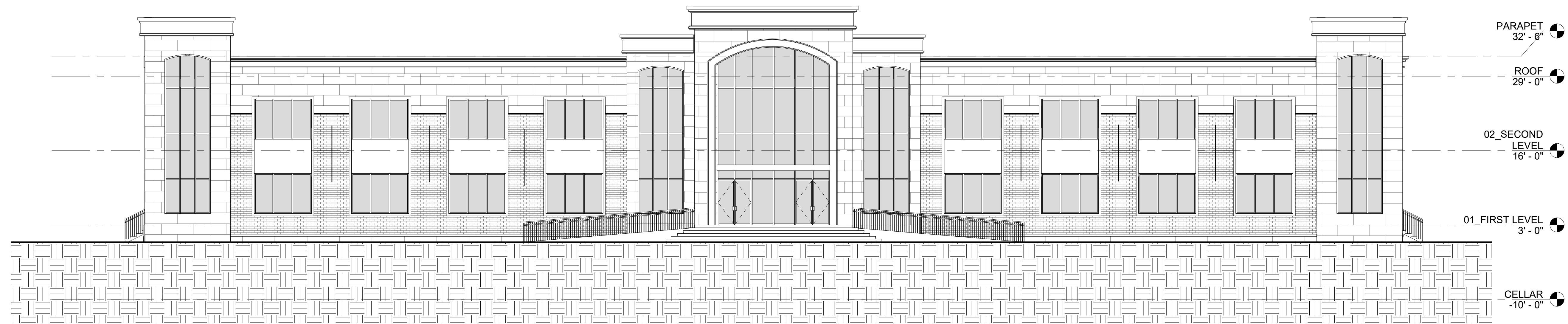
② BUILDING ELEVATION - SOUTH 1" = 10'-0"